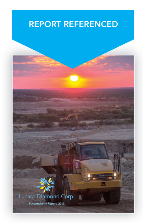
LUCARA'S 2013 SUSTAINABILITY REPORT